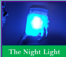
The Night Light