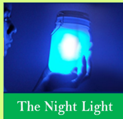
The Night Light